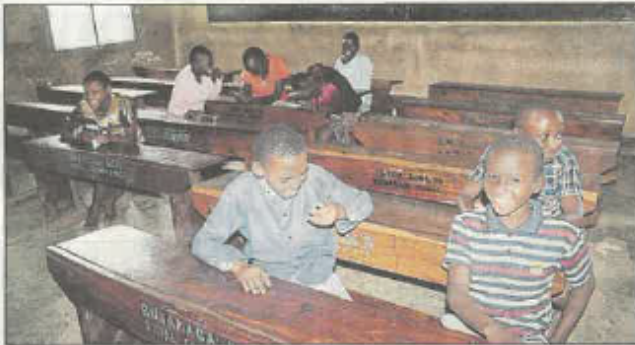
EDUCATION: Children in Eastern Uganda, whose education has benefited from the Fairtrade Premium