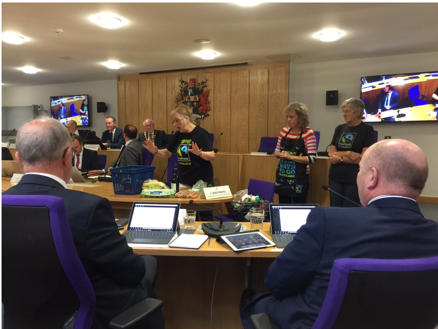
Fairtrade presentation to full Council, September 2019

E-mail: hazelclatworthy@monmouthshire.gov.uk