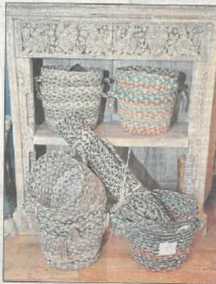
FAIRTRADE: Goods at the Mocking Bird shop in Abergavenny.