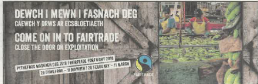
BANNER: Fairtrade Fortnight will start on February 26

For more information on how to get involved with Fairtrade Fortnight, you can visit the Fair Trade Wales website at fairtradewales.com