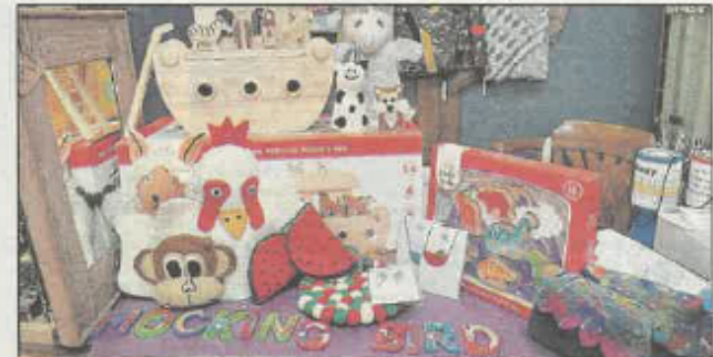
WARES: Fairtrade goods at the Mocking Bird shop in Abergavenny.

poverty and transforming their communities.