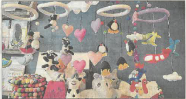
GOODS: Fairtrade goods at the Mocking Bird shop in Abergavenny